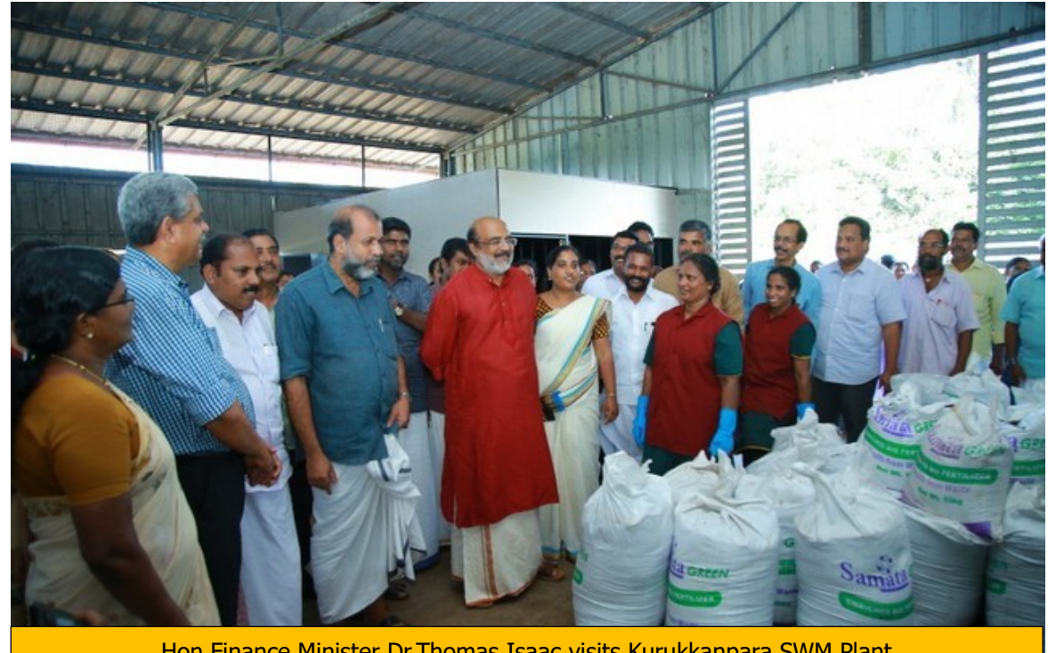
Hon. Finance Minister Dr. Thomas Isaac visits Kurukkanpara SWM Plant