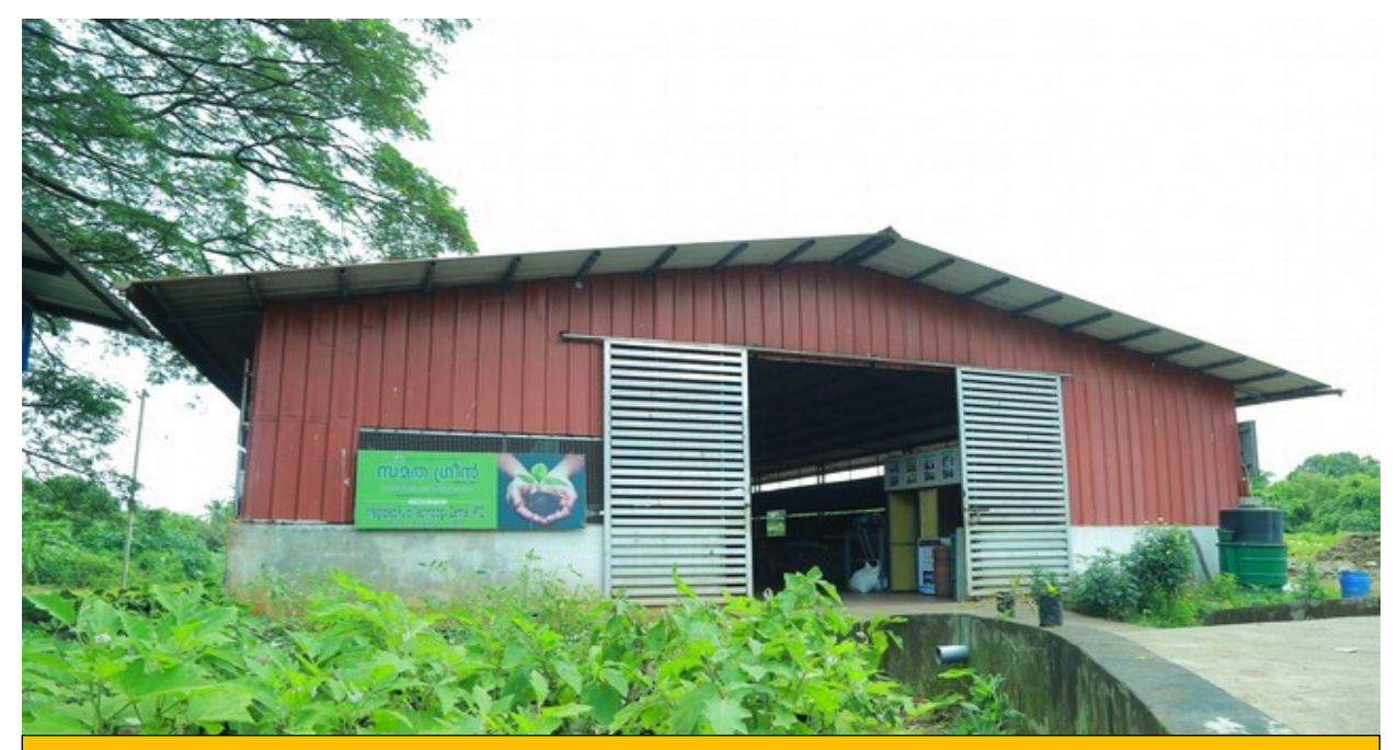
Green Park, Kurukkanpara, Kunnamkulam Municipality (Solid waste management plant) operated and maintained by SHG, Samatha Green