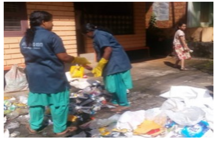
income generation activity for these ULB members.

Kunnamkulam Municipality consists of 37 wards in which average number of households is