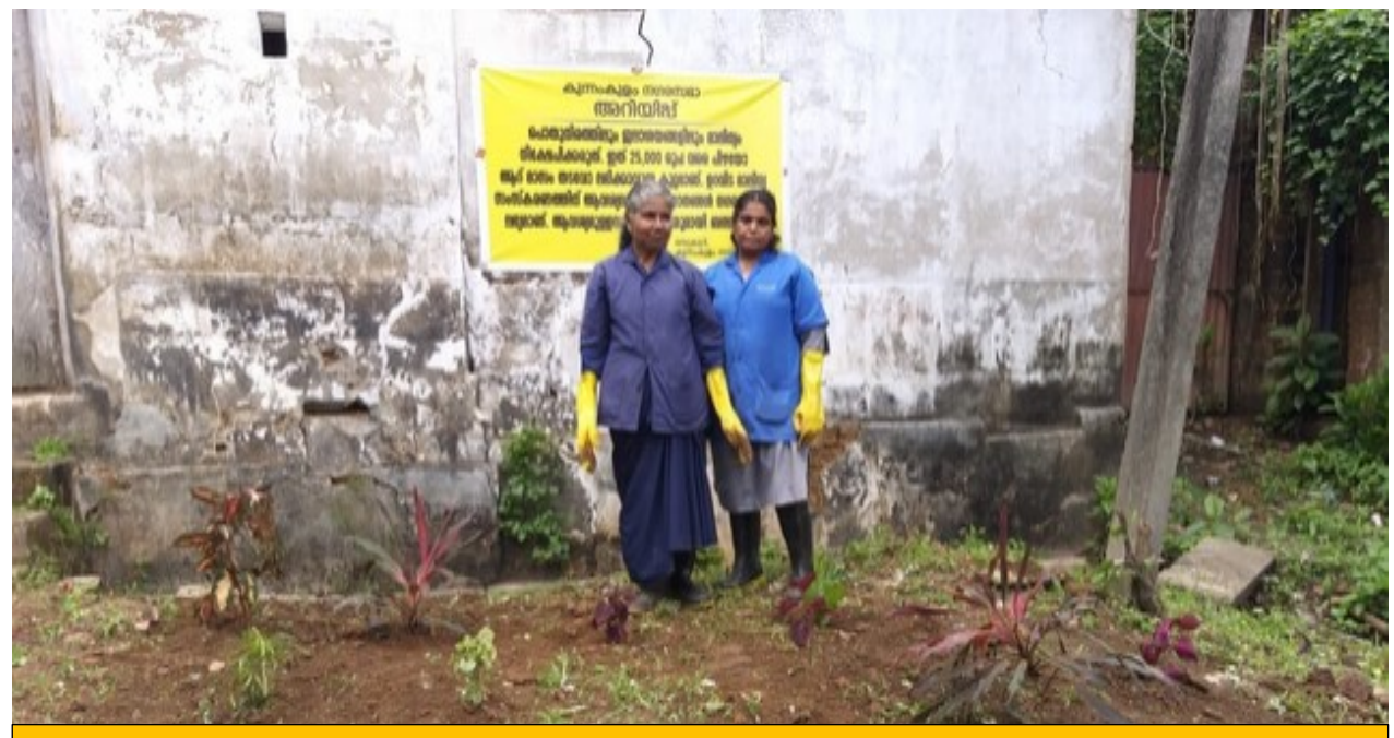
Garbage vulnerble point converted into cultivation land