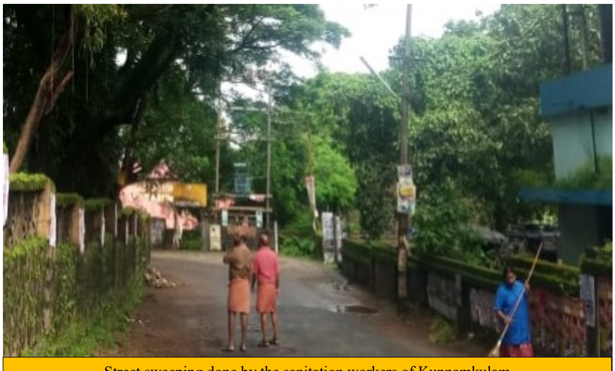
Street sweeping done by the sanitation workers of Kunnamkulam